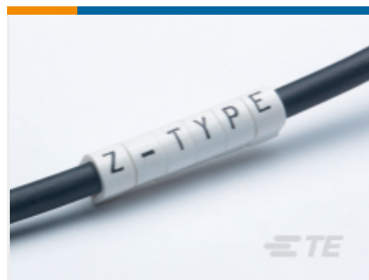
TE Part #EC0593-000 06161911