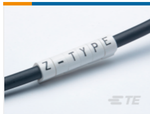
TE Part #EC0592-000 06161910