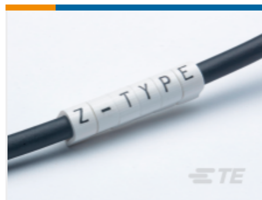
TE Part #EC0594-000 06161912