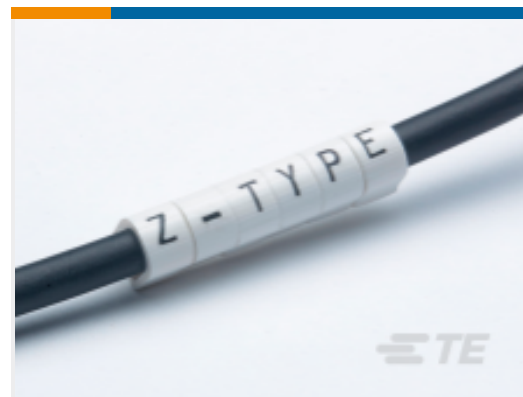
TE Part #EC0572-000 06161101