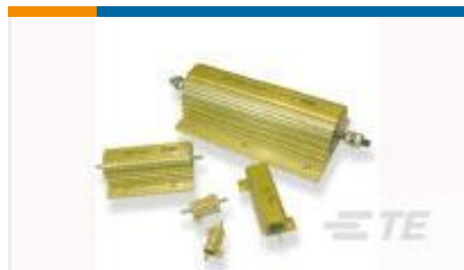
TE Part #1625999-1 HSC100 100R 5%