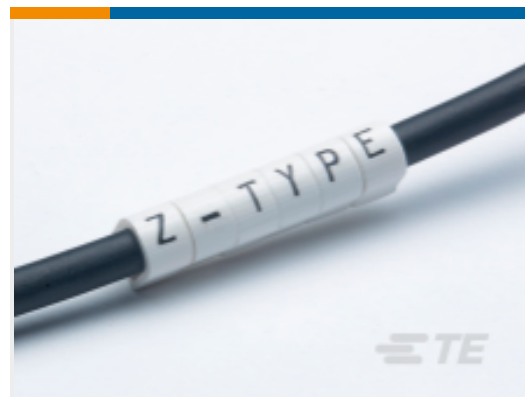
TE Part #EC0591-000 06161909