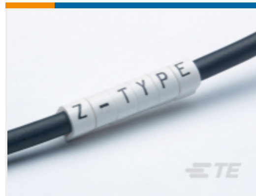
TE Part #EC0396-000 06151916