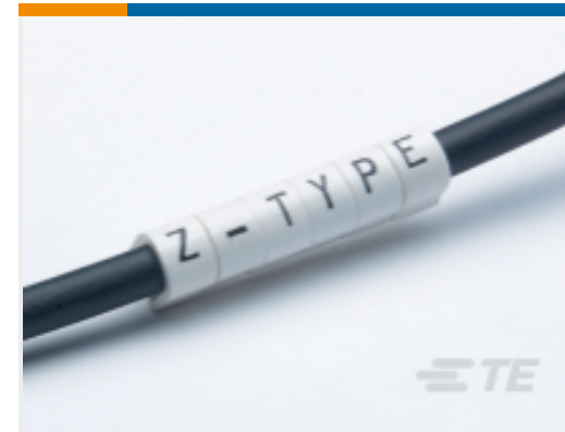
TE Part #EC0384-000 06151904