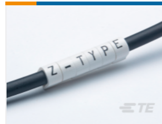
TE Part #EC0407-000 06151927