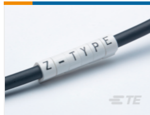
TE Part #EC0400-000 06151920