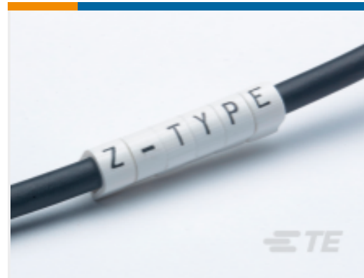
TE Part #EC0381-000 06151901