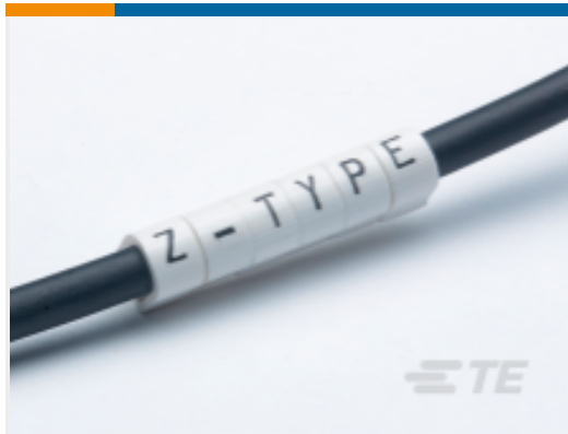
TE Part #EC0382-000 06151902