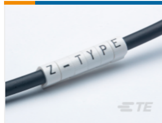
TE Part #EC0387-000 06151907