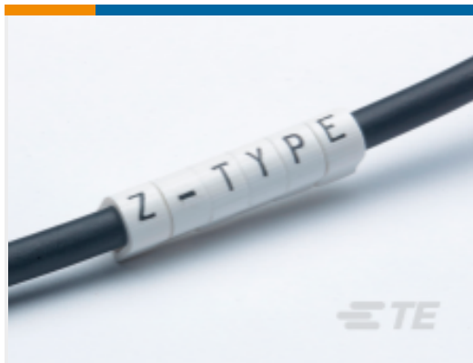
TE Part #EC0383-000 06151903