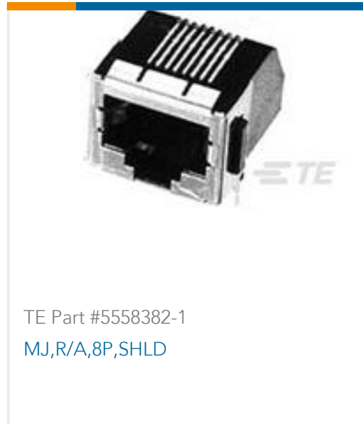
TE Part #5558382-1 MJ,R/A,8P,SHLD