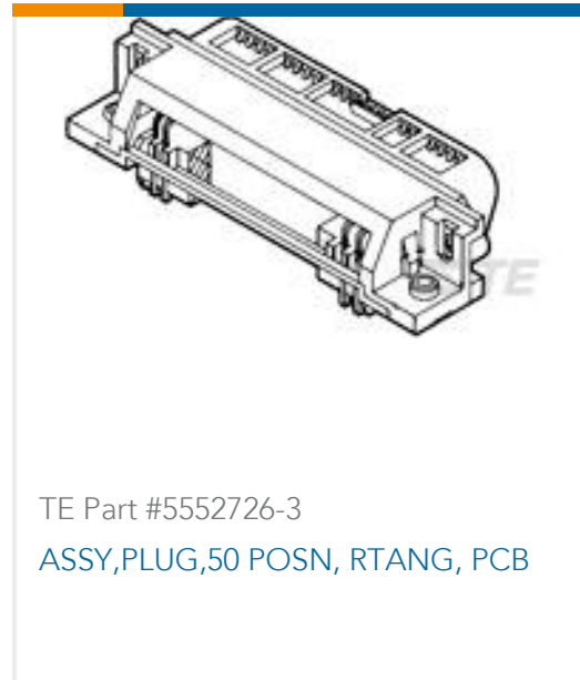
TE Part #5552726-3 ASSY,PLUG,50 POSN, RTANG, PCB