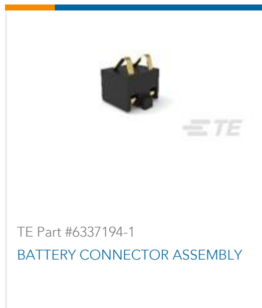
TE Part #6337194-1 BATTERY CONNECTOR ASSEMBLY