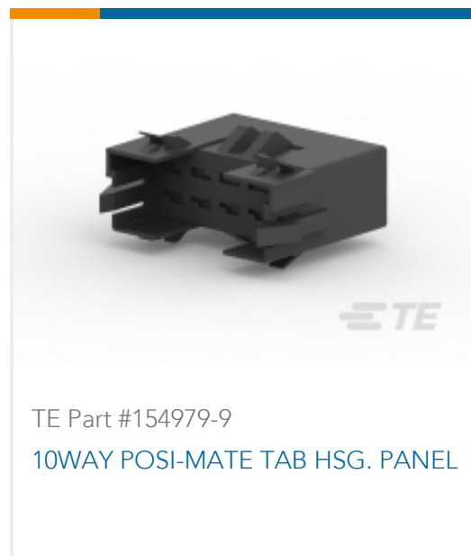
TE Part #154979-9 10WAY POSI-MATE TAB HSG. PANEL