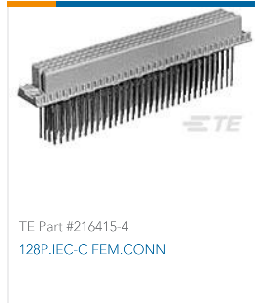
TE Part #216415-4 128P.IEC-C FEM.CONN