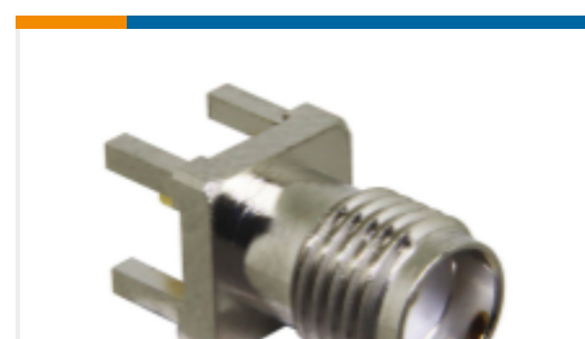
TE Part #CONSMSA001 SMA Jack 50 Ohm PCB Through Hole