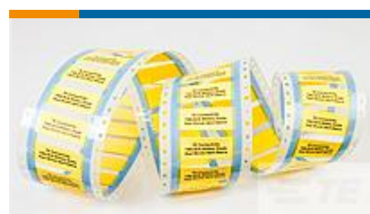
TE Part #5061850001 TMS-SCE-1/2-2.0-9