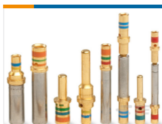
TE Part #38943-20L CONT SOC ASSY