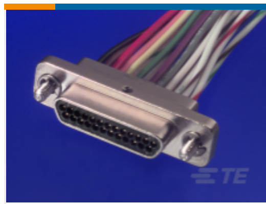
TE Part #1532176-3 M83513/04-F03N, MCKS-N1-B- 37S6G9-18.0