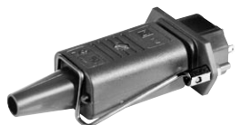
Cord retaining kits Cord retaining strain relief