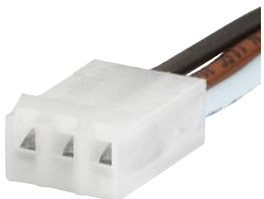
Wire Harness Wire harness for SCHURTER products