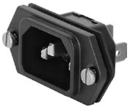
Sealing Kit Sealing for Appliance Inlets