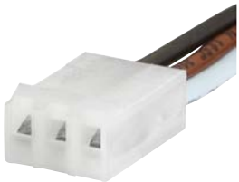
Wire Harness Wire harness for SCHURTER products