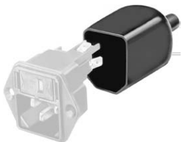
Assorted Covers Rear Cover