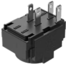
61-8102.02 Diode element