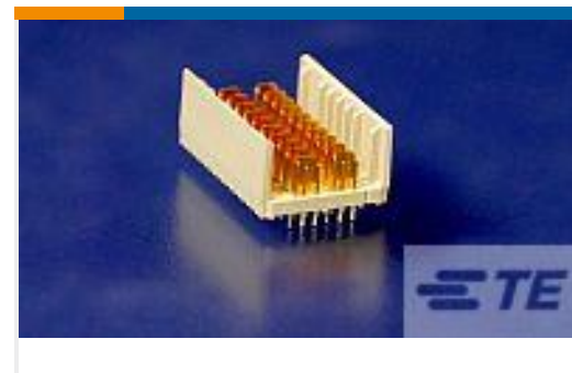
TE Part #6469076-1 HM-ZD 2PR HDR ASSY 1.8MM