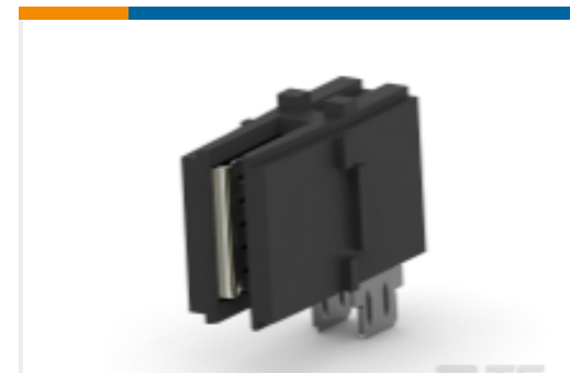
TE Part #2178410-1 CROWN CLIP JUNIOR CONN