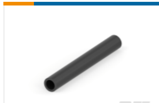
TE Part #463453J001 Versafit-V2 Heat Shrink Tubing