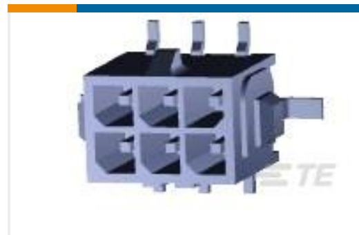
TE Part #3-794636-6 06P MICRO MNL ASSY,VRT,SMT,LF