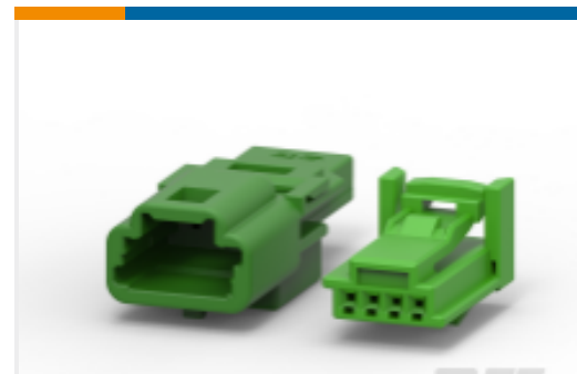
TE Part #1318620-2 TH/.025 CONNECTOR SYSTEM, HOUSING