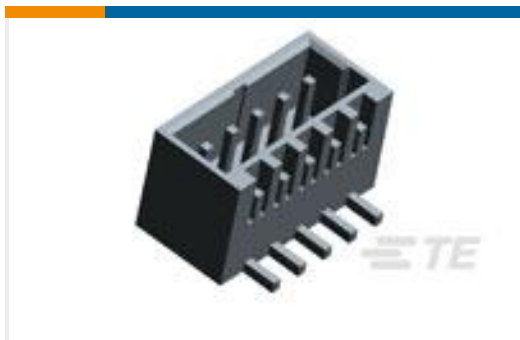
TE Part #5-1775443-2 EMIX CONN., 1.5MM PITCH, HDR, V/T, 2P