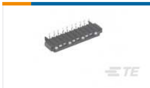
TE Part #6-520314-3 TRIOMATE ASSY H 13P L=2.54LDFR