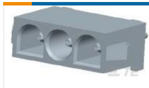
TE Part #2029395-1 03P UMNL PIN HDR ASY 94VO NODH