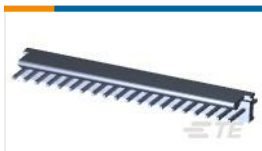
TE Part #2-640456-0 20P MTA100 HDR ASSY F/L SQ STR