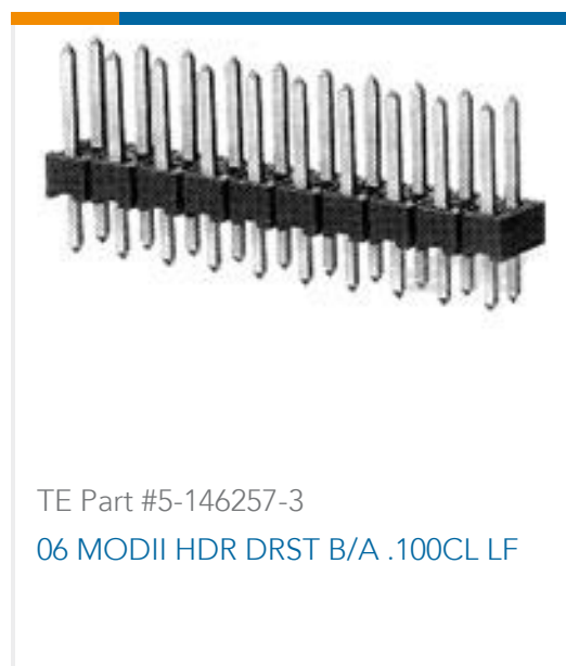
TE Part #5-146257-3 06 MODII HDR DRST B/A .100CL LF