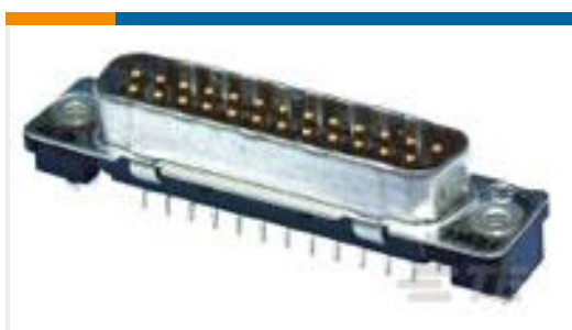
TE Part #1-5747871-4 09 PLUG SP/FMS SCRLK