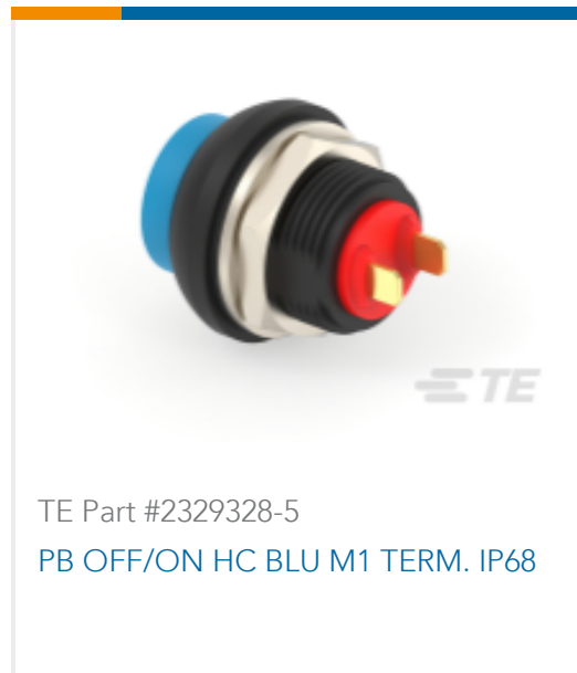
TE Part #2329328-5 PB OFF/ON HC BLU M1 TERM. IP68