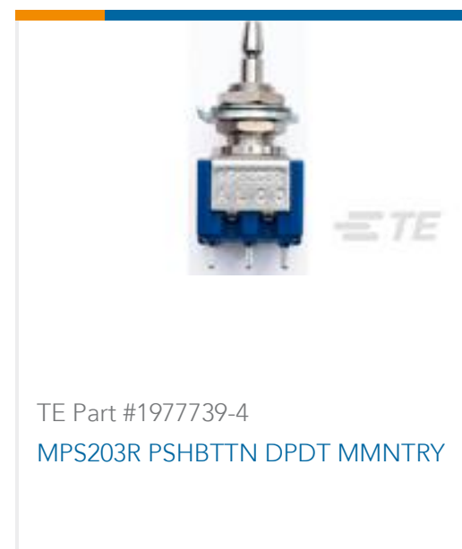
TE Part #1977739-4 MPS203R PSHBTTN DPDT MMNTRY