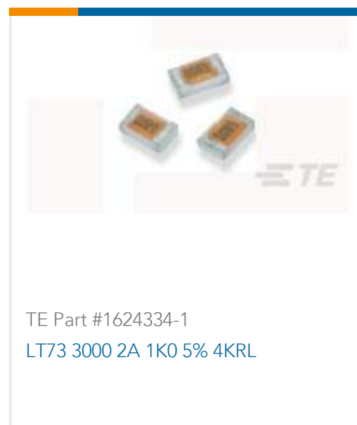
TE Part #1624334-1 LT73 3000 2A 1K0 5% 4KRL