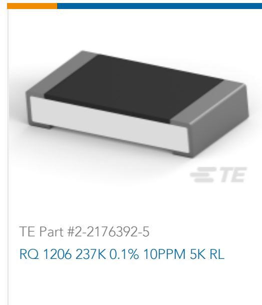
TE Part #2-2176392-5 RQ 1206 237K 0.1% 10PPM 5K RL