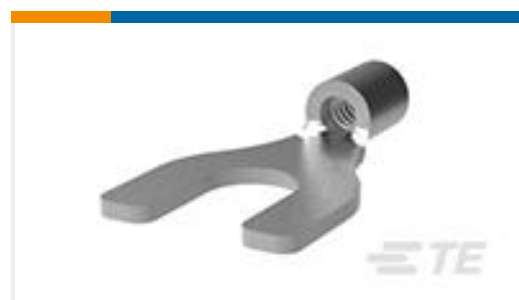
TE Part #323127 SOLIS SPD 22-16COMM 22-18MIL 6