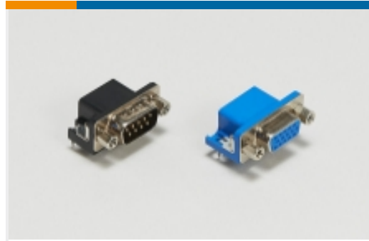
PCB D-Sub Connectors(172)