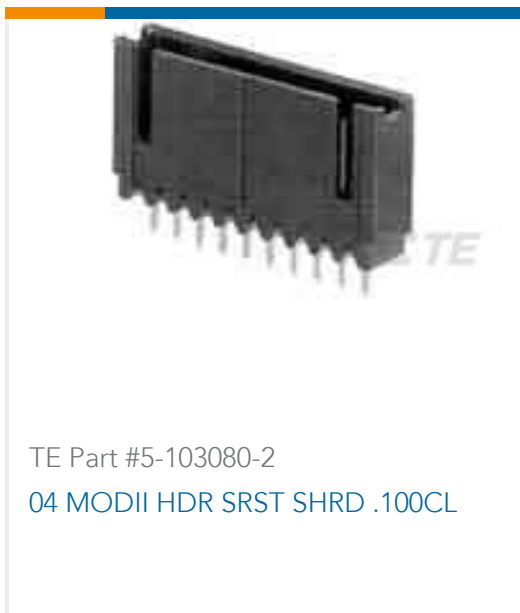
TE Part #5-103080-2 04 MODII HDR SRST SHRD .100CL