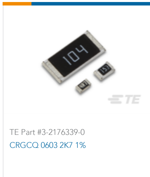
TE Part #3-2176339-0 CRGCO 0603 2K7 1%