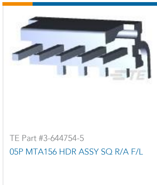
TE Part #3-644754-5 05P MTA156 HDR ASSY SQ R/A F/L