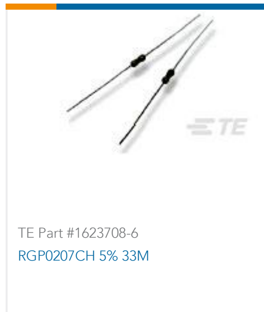
TE Part #1623708-6 RGP0207CH 5% 33M