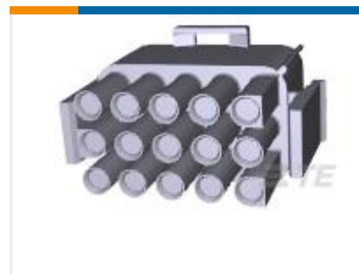
TE Part #350736-1 15P UMNL PLUG HSG