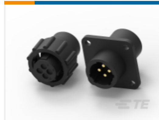
TE Part #211400-1 Cable/Panel Mount Connector, CPC Series 1