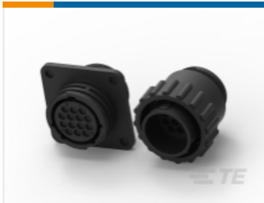
TE Part #206429-1 Circular Connector, Environmentally Sealed, CPC Series 6