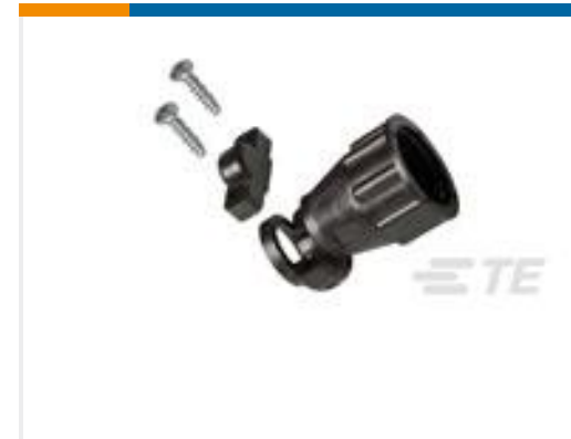
TE Part #1-206062-6 CABLE CLAMP KIT #11