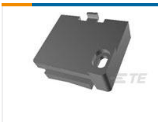
TE Part #1-640724-0 15P UMNL STR/REL & INSRT NATL