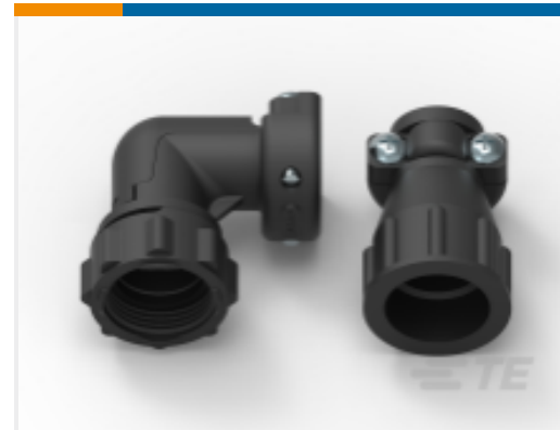
TE Part #206138-8 CPC Cable Clamps