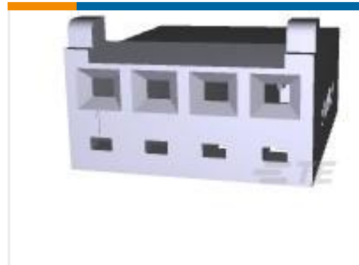
TE Part #1375820-4 CST-100 II HOUSING 4 POS