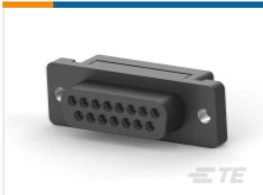
TE Part #1658609-4 IDC D-Sub: Receptacle Assembly, Low Profile, Signal, 2.77 mm