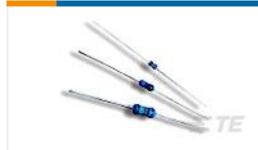
TE Part #1622215-1 LR0204 1% 30R