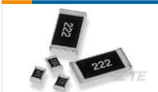
TE Part #1623231-1 CRG0805 1% 470K