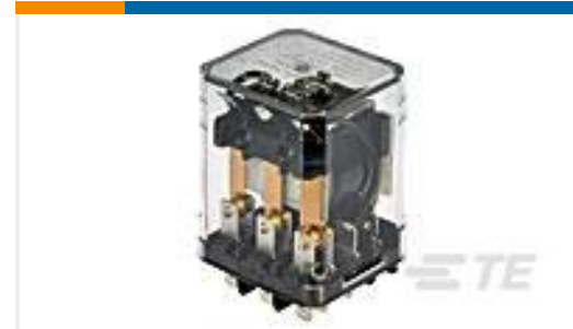
TE Part #1-1393117-4 KUP-11AT5-120=KU