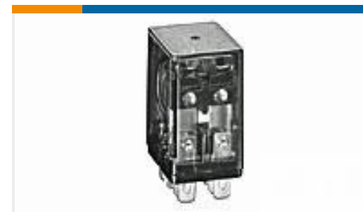
TE Part #5-1393144-0 K10P-11DT5-12=K10/K20