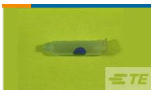
TE Part #654557-000 D-436-0185