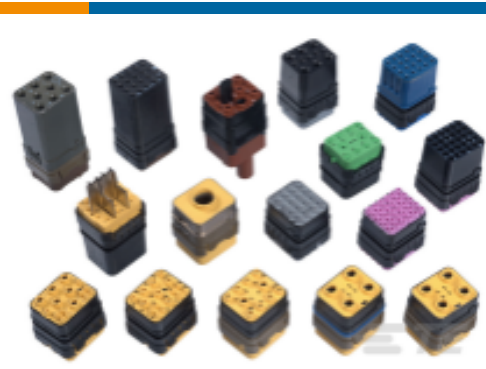
TE Part #ZPF000000000015289 DMC-M 20-22 AC