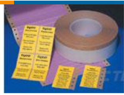
TE Part #318606-000 TTVF075YW-100