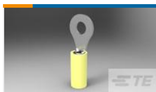
TE Part #8-35149-2 TERMINAL,PIDG R 12-10 6