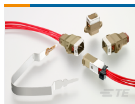
TE Part #CTJ620E06N-5145 PLUG ASSY