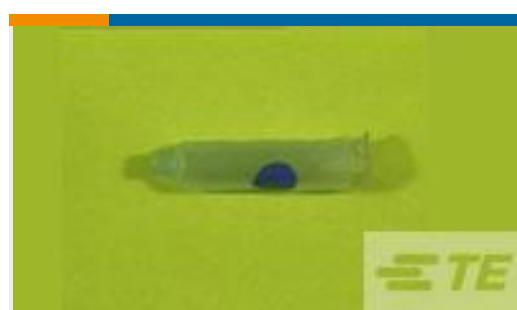
TE Part #617867-000 D-436-0186