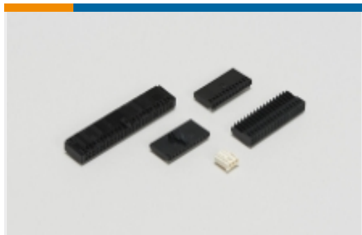
Wire-to-Board Connector Assemblies & Housings(17)