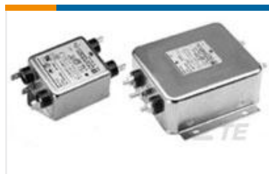
TE Part #6609043-2 6VV1=F7251 S0