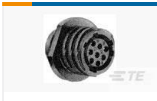
TE Part #206433-2 CPC RECPT ASSEMBLY SIZE 11-8