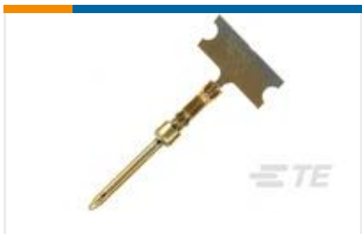
TE Part #66507-4 HD 20 DF PIN PLTD