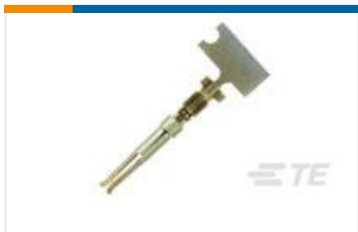
TE Part #1658538-3 SOCKET CONT DUPL PLT STRIP HD-