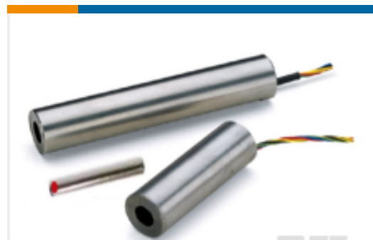
TE Part #02560390-000 LVDT HR 100 ASSY