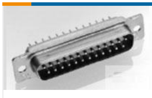
TE Part #204511-1 AMPLIMITE,ASY,PLUG,STD,90,6