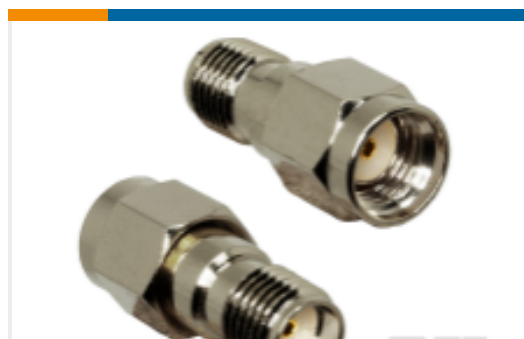
TE Part #ADP-RPSM-SMAF RP-SMA Plug to SMA Jack