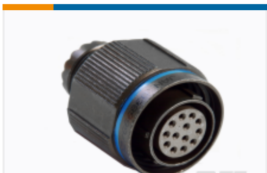
TE Part #YDTS26W21-16SNV001 PLUG ASSY