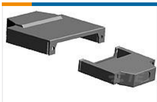
TE Part #5788362-1 .8MM CHAMP BACKSHELL KIT