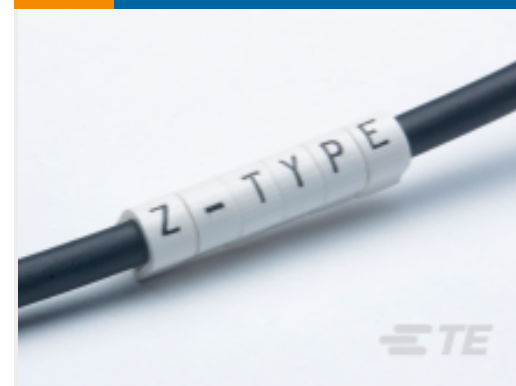
TE Part #EC0215-000 05811902