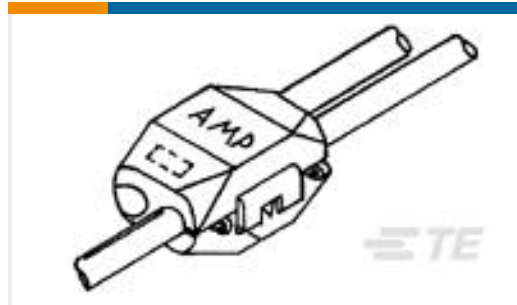
TE Part #735398 ELECTRO-TAP ASSY