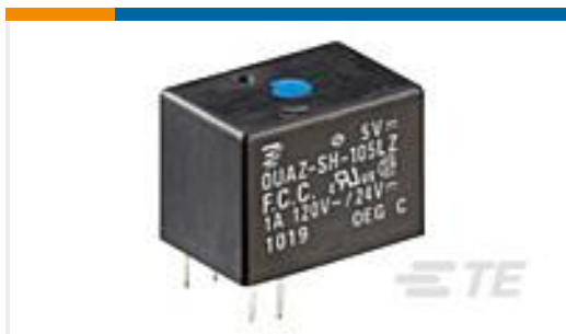
TE Part #4-1419145-8 OUAZ-SH-124L,900