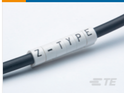
TE Part #EC0233-000 05811920