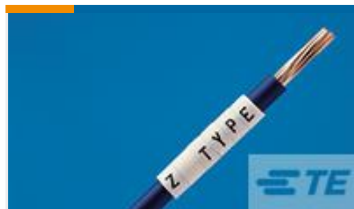
TE Part #930554-000 12510000