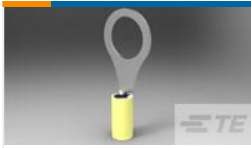
TE Part #160138 PIDG RING TONGUE