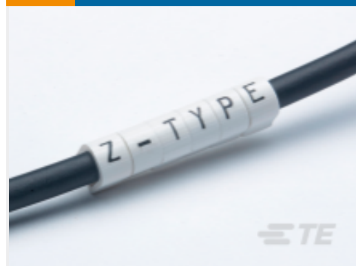
TE Part #EC0214-000 05811901