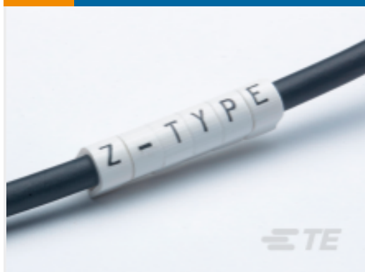
TE Part #EC0230-000 05811917