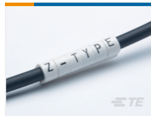
TE Part #EC0214-000 05811901