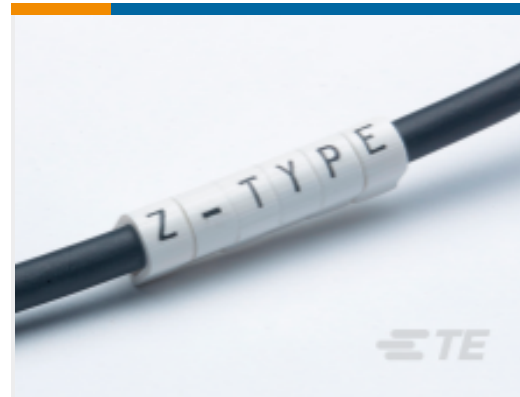
TE Part #EC0222-000 05811909