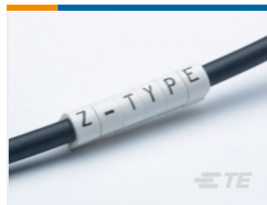
TE Part #EC0213-000 05811900