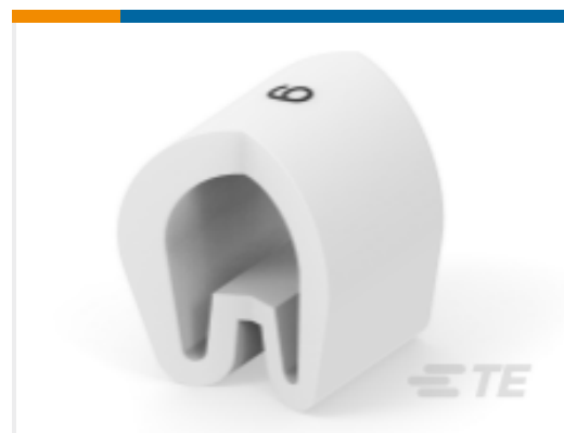
TE Part #EC0311-000 05813906