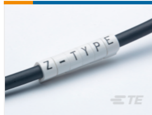
TE Part #EC0221-000 05811908