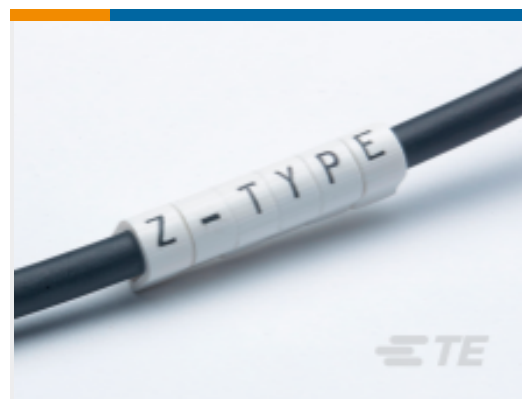
TE Part #EC0220-000 05811907