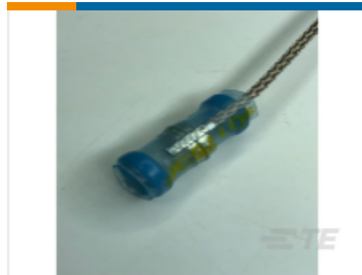
TE Part #274869-000 SO63-1-9036-20