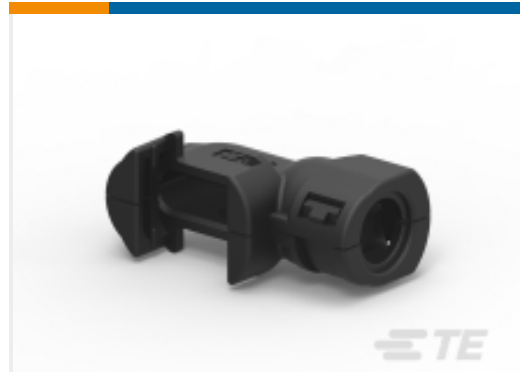
TE Part #2272169-1 MCON WIRE DRESS, 2P PLUG, RIGHT ANGLE