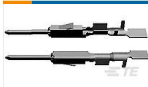
TE Part #6-928918-1 MQS0,63 Sn tab LL unseal. 0,2-0,35