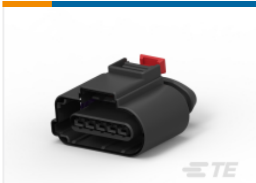
TE Part #1-1355200-1 AMP MCP, SEALED CONNECTOR HOUSING