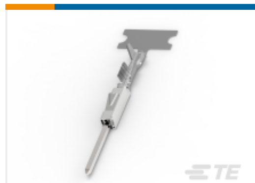
TE Part #6-928918-3 MQS0,63 Ag tab LL unseal. 0,2-0,35