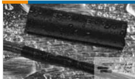
TE Part #829131P021 ES2000-NO.1-C1-0-STK