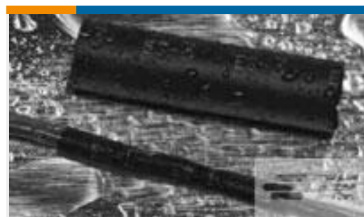
TE Part #CP4928-000 ES2000-NO.3-B8-0-STK-SH