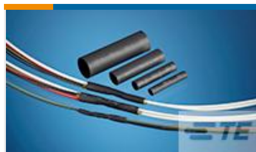
TE Part #2525596019 RBK-ILS-125-NR1-0-23MM