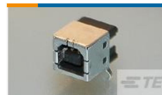
TE Part #292304-1 STD USB TYPE B, R/A, T/H