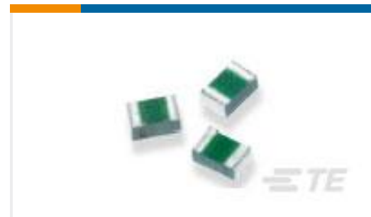
TE Part #1624362-1 NTC0805 5% 470R