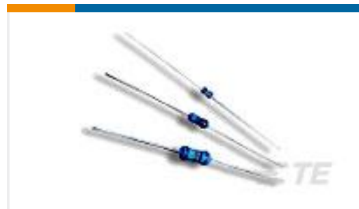
TE Part #9-1879026-0 YR1 0.1% 49R9