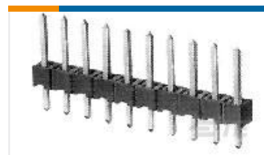
TE Part #825433-4 MOD 2 PINHDR 1X4 P.