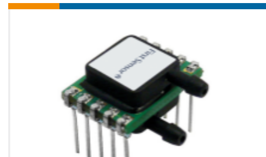
TE Part #1006943-F LDES500UF6S;PRES;0-500Pa;0,5-4,5V; 5Vs