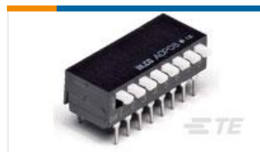
TE Part #2-1571999-6 ADP0804=PIANO DIP SWITCH