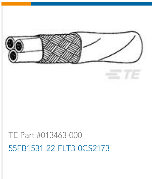
TE Part #013463-000 55FB1531-22-FLT3-OCS2173