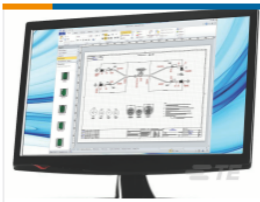
TE Part # 9-120035-5 HarnWare/HarnVis Purchase Charge