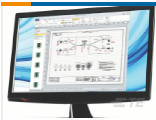
TE Part # 9-120035-6 HarnWare/HarnVis Renewal Charge