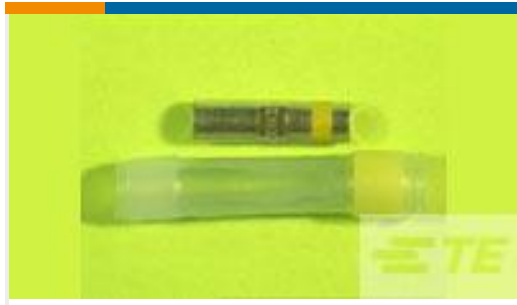
TE Part # 650075-000 D-436-37