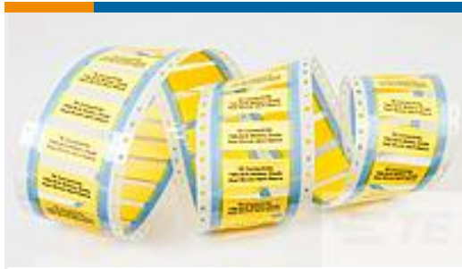
TE Part #6632750001 TMS-SCE-3/32-2.0-9