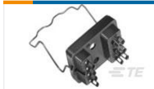
TE Part #1393824-4 V23154Z1005