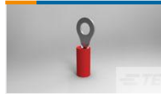
TE Part #320554 PIDG R 22-16 COMM 22-18 MIL 8