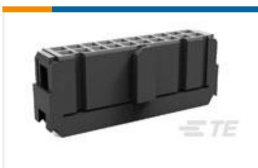
TE Part #1-1658621-0 50 NOVO MIL/CTR 15DP, LEAD FREE