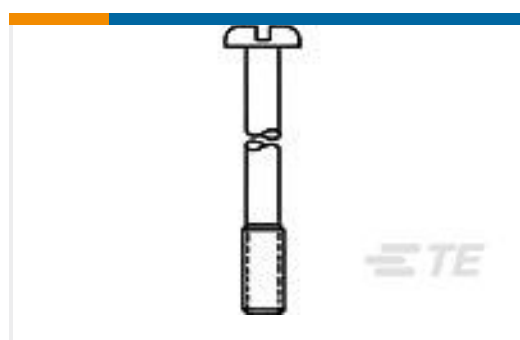
TE Part #5229996-2 SCREW, PAN HD, CAPTIVE