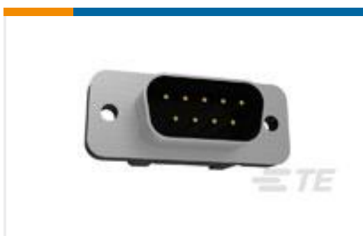
TE Part #1658608-4 09 POS HDF PLUG, MS, LEAD FREE