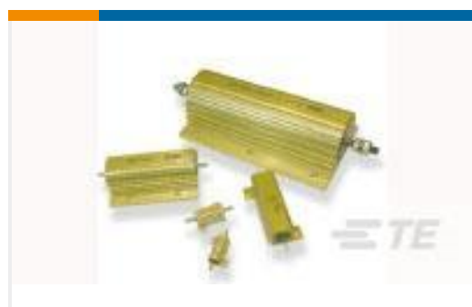
TE Part #1625984-1 HSA50 100R 5%