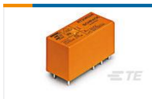
TE Part #4-1393238-6 RTB74024