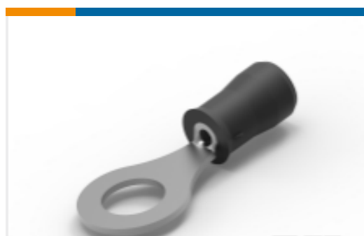
TE Part #2-320552-1 PIDG Ring Tongue Terminals