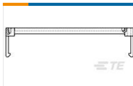
TE Part #747275-4 009 LP HDF STRAIN RELIEF