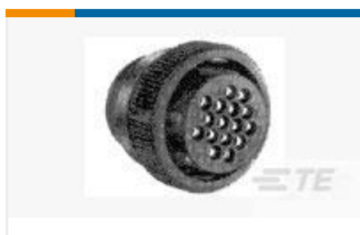
TE Part #206837-3 CPC PLUG ASSEMBLY SIZE 23-24