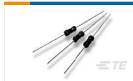
TE Part #5-1879351-5 RR01 5% 510K AMMO