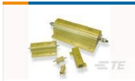
TE Part #9-1625966-8 HSA10 10R 1%