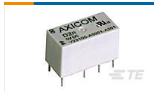
TE Part #2-1393793-3 V23105A5506A201