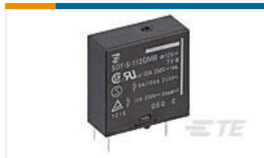
TE Part #8-1419125-5 SDT-S-106LMR,000