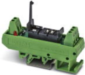
VARIOFACE base module for G2R relay, 2PDT

Please be informed that the data shown in this PDF Document is generated from our Online Catalog. Please find the complete data in the user's documentation. Our General Terms of Use for Downloads are valid ( http://phoenixcontact.com/download )