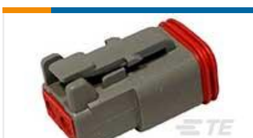
TE Part # DT06-2S PLG, 2P, GRY, N