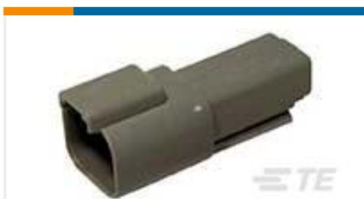
TE Part # DT04-2P REC, 2P, GRY, N