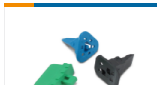
TE Part # W2S Wedgelocks: DEUTSCH DT