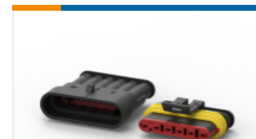
TE Part # 282104-1 AMP SUPERSEAL 1.5MM, CONNECTOR HOUSING