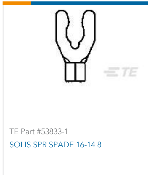
TE Part #53833-1 SOLIS SPR SPADE 16-14 8