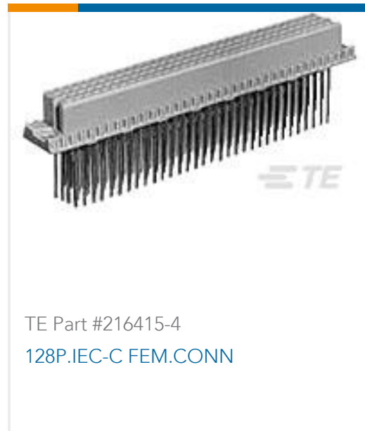
TE Part #216415-4 128P.IEC-C FEM.CONN