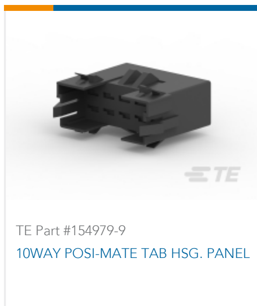
TE Part #154979-9 10WAY POSI-MATE TAB HSG. PANEL