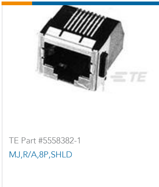
TE Part #5558382-1 MJ,R/A,8P,SHLD