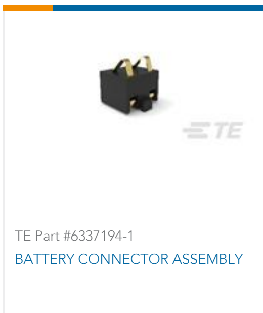
TE Part #6337194-1 BATTERY CONNECTOR ASSEMBLY