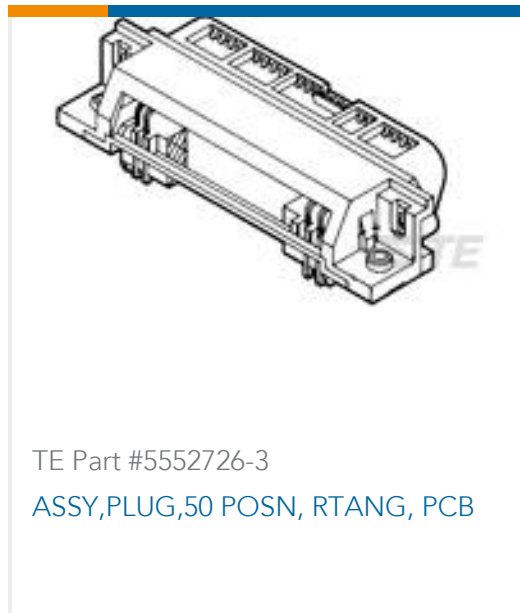
TE Part #5552726-3 ASSY,PLUG,50 POSN, RTANG, PCB