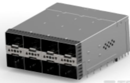
TE Part #3-2339978-3 SFP56 STACKED 2X4 RECEPTACLE ASSEMBLY