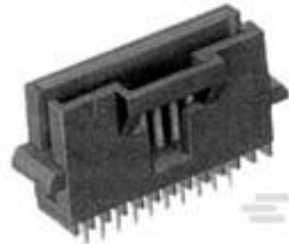
TE Part #5-104071-5 25 SYSTEM 50 HDR SRST SHRD SN