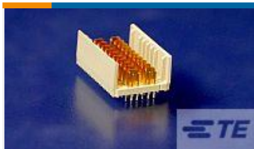
TE Part #1469734-1 HM-ZD 2PR HDR 40P SEQ, LF