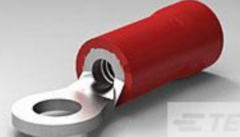
TE Part #34141 PG R 22-16 COMM 22-18 MIL 4