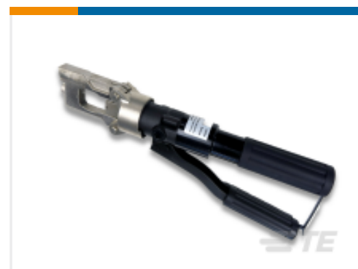
TE Part # 539783-1 HZ FUER HOCHSTROMKO