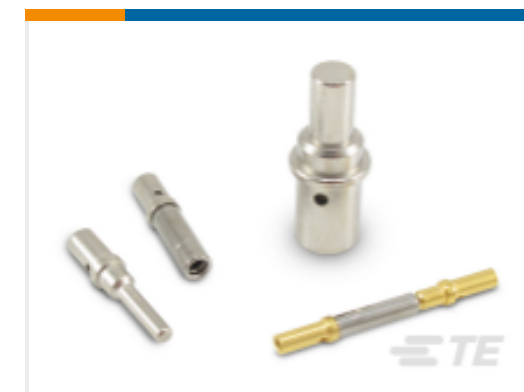
TE Part #0462-201-16141 DEUTSCH Solid Contacts