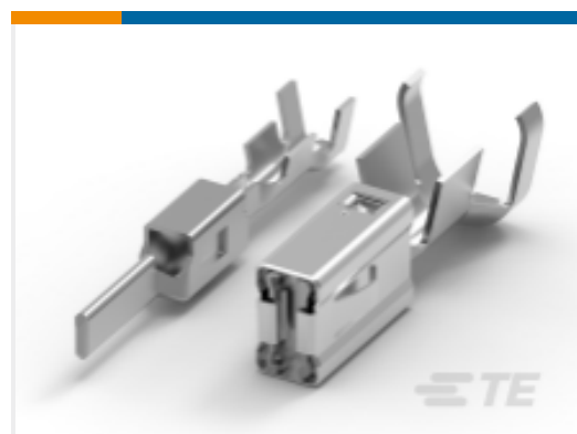
TE Part # CAT-AM705-T273 AMP MCP, RECEPTACLE AND TAB