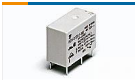
TE Part #1461352-2 PCH-105L2M,000