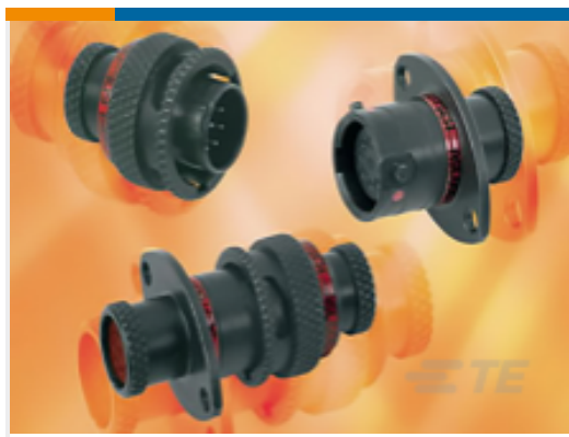
TE Part #ASDD006-09SN-HE RECEPTACLE ASSEMBLY ASL 9-WAY