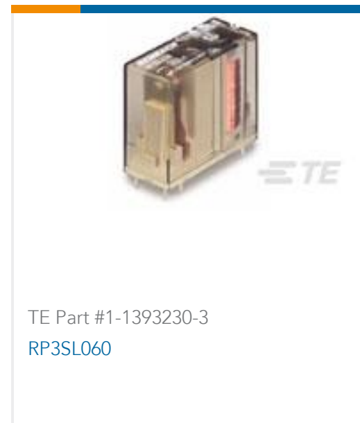
TE Part #1-1393230-3 RP3SL060