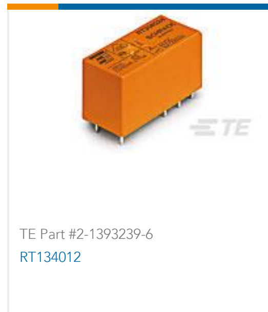
TE Part #2-1393239-6 RT134012