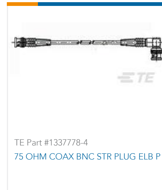
TE Part #1337778-4 75 OHM COAX BNC STR PLUG ELB P