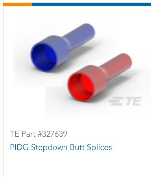
TE Part #327639 PIDG Stepdown Butt Splices