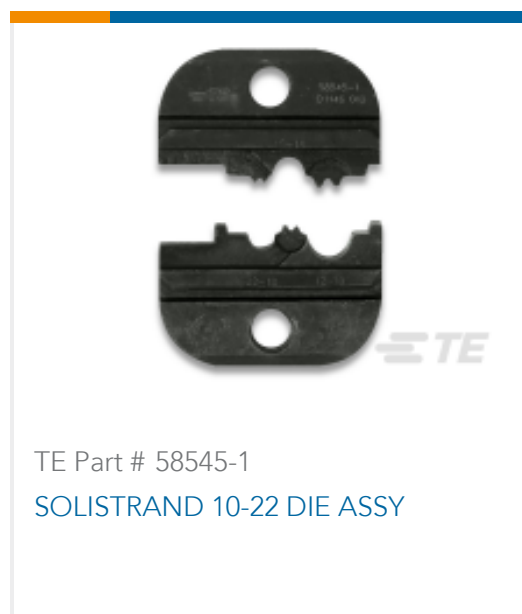
TE Part # 58545-1 SOLISTRAND 10-22 DIE ASSY