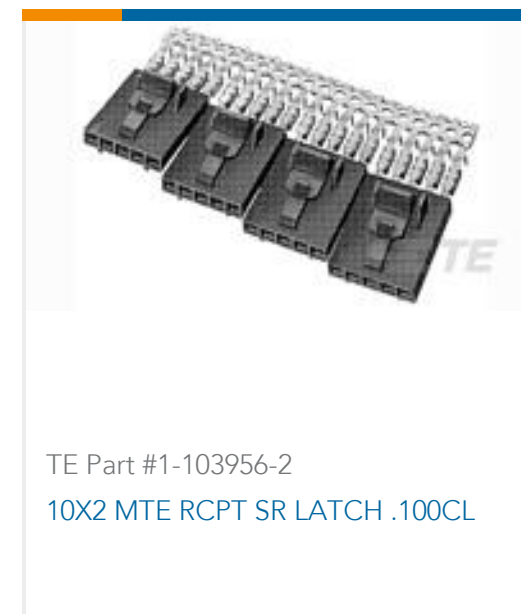
TE Part #1-103956-2 10X2 MTE RCPT SR LATCH .100CL