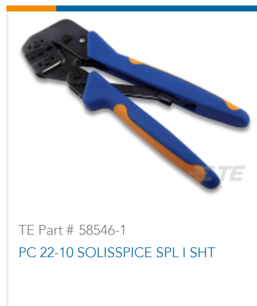
TE Part # 58546-1 PC 22-10 SOLISSPICE SPL I SHT