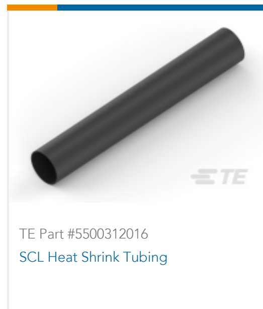
TE Part #5500312016 SCL Heat Shrink Tubing