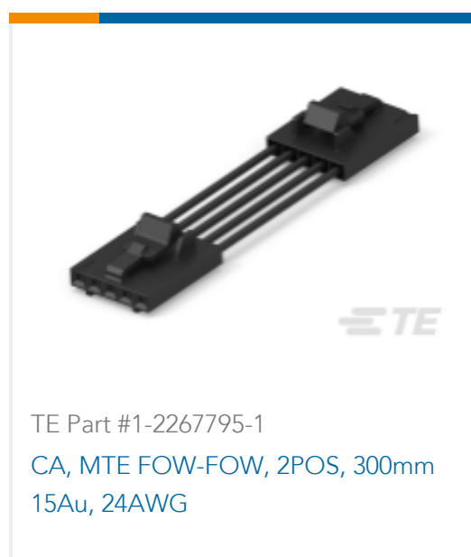
TE Part #1-2267795-1 CA, MTE FOW-FOW, 2POS, 300mm 15Au, 24AWG