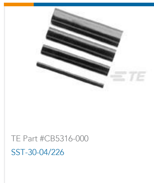
TE Part #CB5316-000 SST-30-04/226