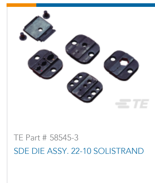
TE Part # 58545-3 SDE DIE ASSY. 22-10 SOLISTRAND