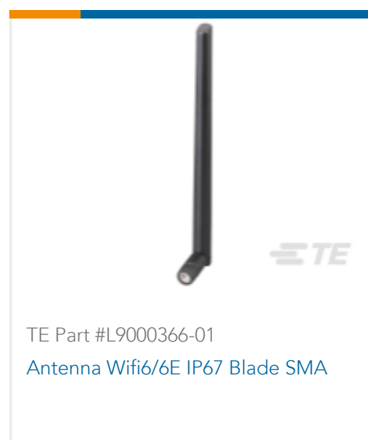
TE Part #L9000366-01 Antenna Wifi6/6E IP67 Blade SMA