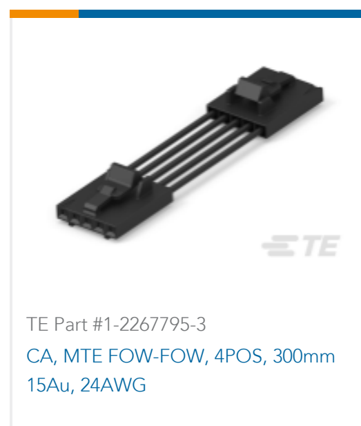
TE Part #1-2267795-3 CA, MTE FOW-FOW, 4POS, 300mm 15Au, 24AWG