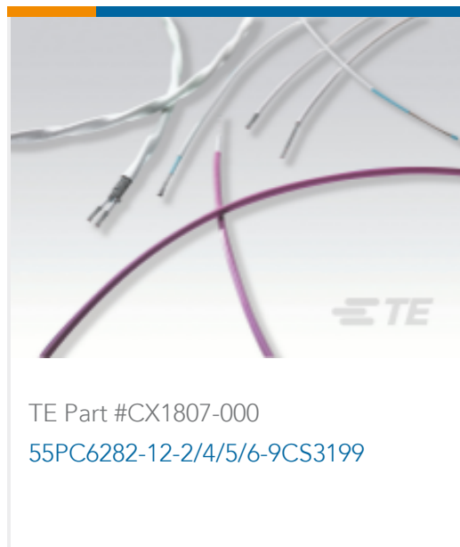
TE Part #CX1807-000 55PC6282-12-2/4/5/6-9CS3199