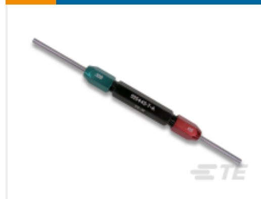
TE Part #525442-7 PLUG GAUGE, HANDTOOL