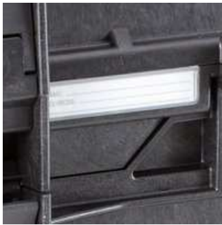
PVC waterproof ID removable label