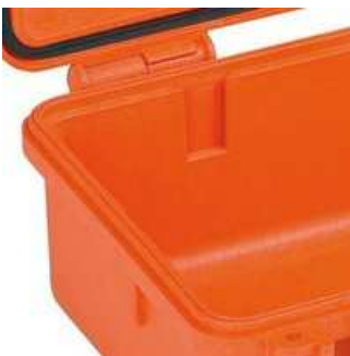
Internal slots for optional panel mounting brackets or panel mounting rings