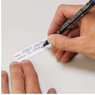
(Art. LABELCOVER + nr. art.)