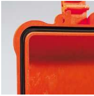
(Art. NEOSEAL + nr. art.)