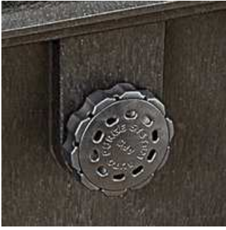
Automatic pressure release valve.