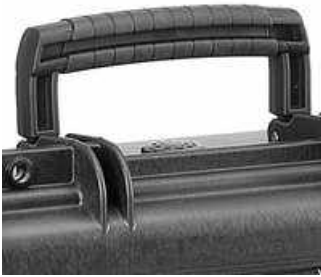
Load tested handle, reinforced with corrosion proof steel pins