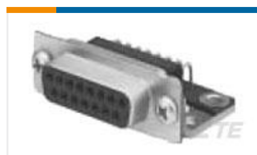
TE Part #5745116-1 50 RCPT RA/MS STD