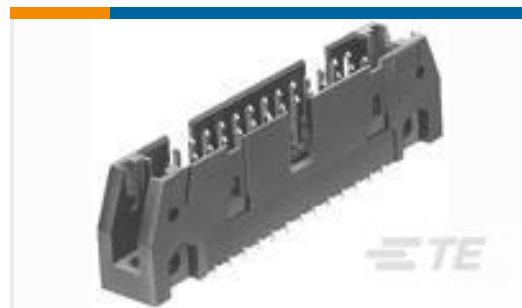
TE Part #1-5102154-1 A/L UNIV HDR 60P VERT