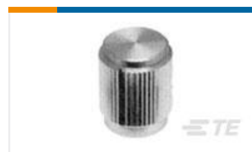
TE Part #5-1437622-8 KN700A1/4=KNOB ALUM KNURL 1/4