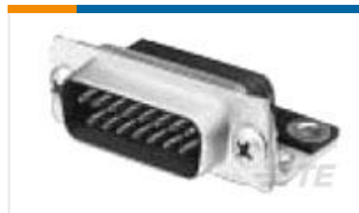
TE Part #5745436-3 25 PLUG RA/MS 454