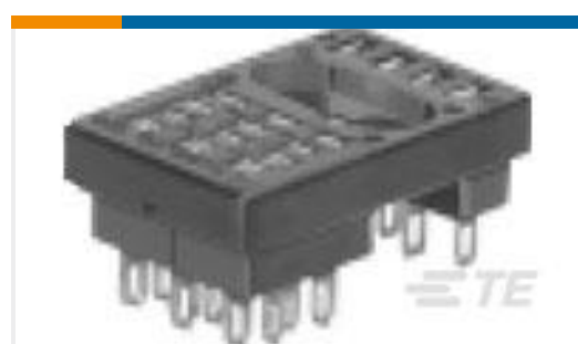
TE Part #2-1393143-5 27E213=SOCKET,R10,16,PC,PHEN