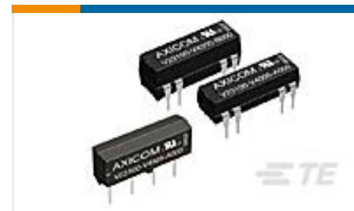
TE Part #4-1393763-4 V23100V4505A000