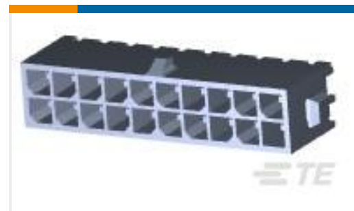
TE Part #5-794632-0 20P MICRO MNL ASSY,VRT,HDR,LF