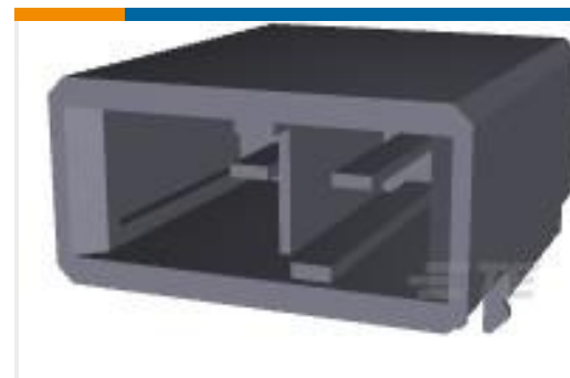
TE Part #1-179276-2 DYNAMIC 3200 HDR ASSY 2P H