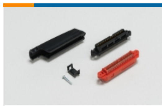
IDC D-Sub Connectors(6)