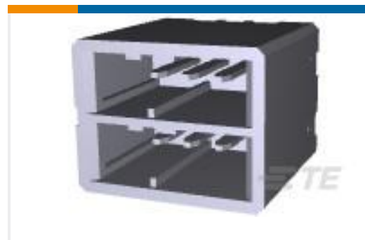
TE Part #1-178141-2 DYNAMIC CONN 6P V HDR ASSY