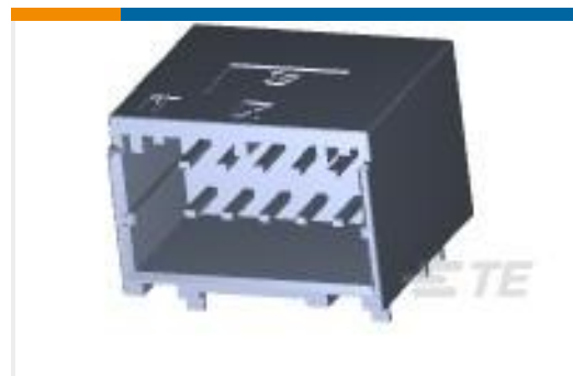
TE Part #1-1827876-6 DYNAMIC 1200D HDR ASSY H 12PX BLACK GOLD