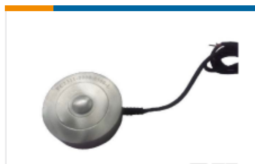
TE Part #FC2311-0000-0250-L FC23 MV 2FT CABLE 250L