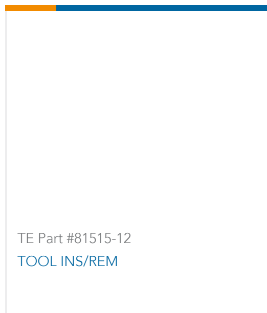
TE Part #81515-12 TOOL INS/REM