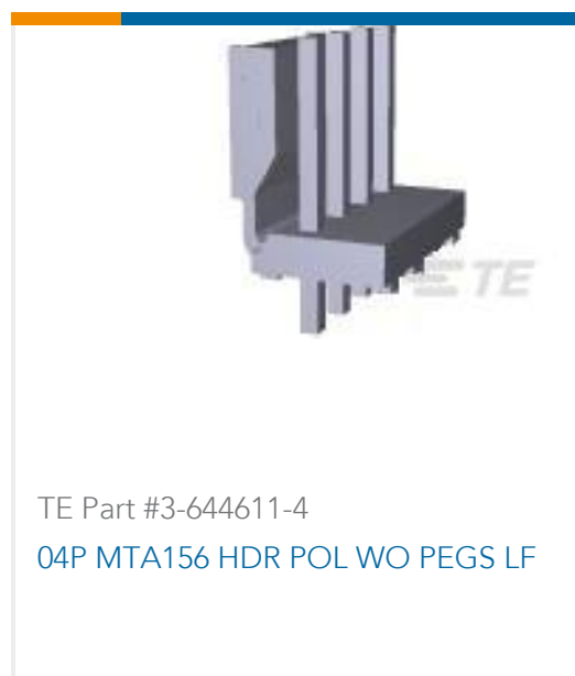
TE Part #3-644611-4 04P MTA156 HDR POL WO PEGS LF