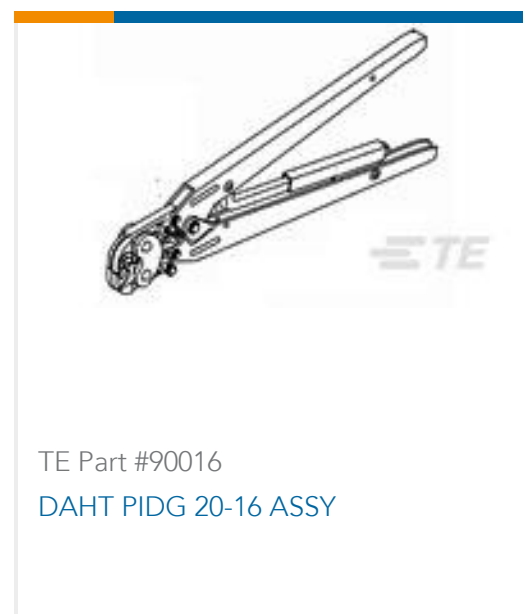
TE Part #90016 DAHT PIDG 20-16 ASSY