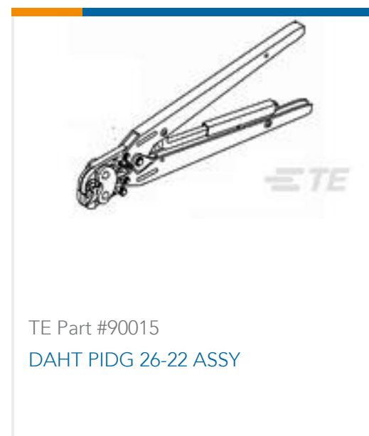
TE Part #90015 DAHT PIDG 26-22 ASSY