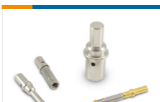
TE Part #0462-201-16141 DEUTSCH Solid Contacts