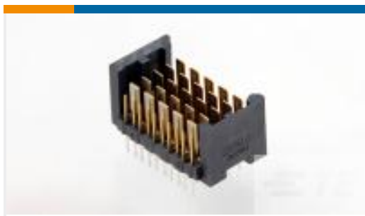
TE Part # 5120794-1 ZP HS3 DB 10R REC 050P RT PD P