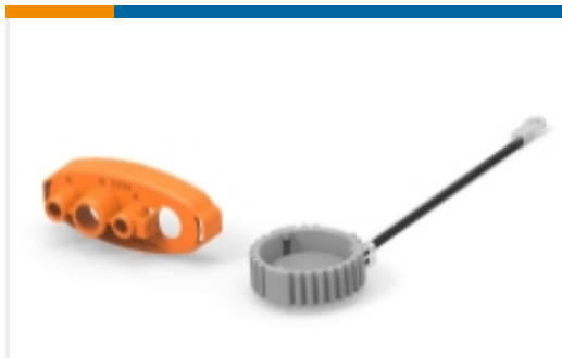
Connector Caps & Covers(2)