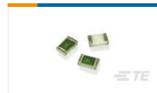
TE Model / Part #2-2176091-2 RP 2A 0.25W 95R3 0.1% 25PPM 1K RL