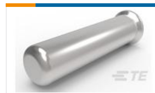
TE Model / Part #147444-1 SOCKET,MIN-SPR AU-AU SER-1