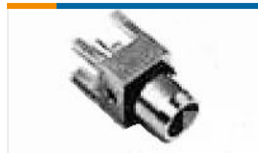
TE Model / Part #1059919-1 4763 0000 00