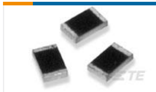
TE Model / Part #9-1879743-5 RP 1J 45R3 0.1% 15PPM CUT LENGTH