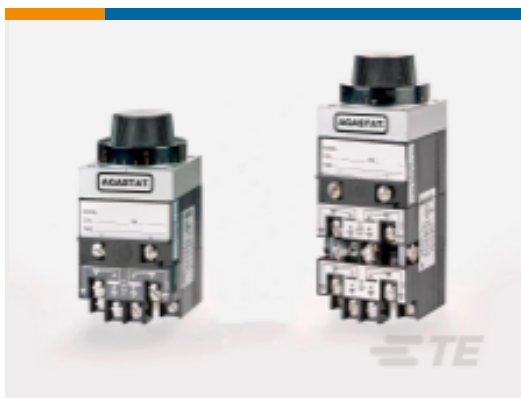
TE Part #1-1423158-1 7012L8DN=RLY,NAV,ON,2P,115VAC,