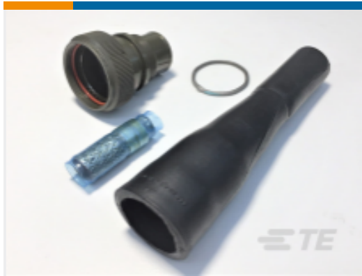
TE Part #C65985-000 5420-12-230408A-CS2360