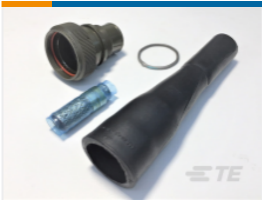
TE Part #059737N001 5428-10-441116-CS2359