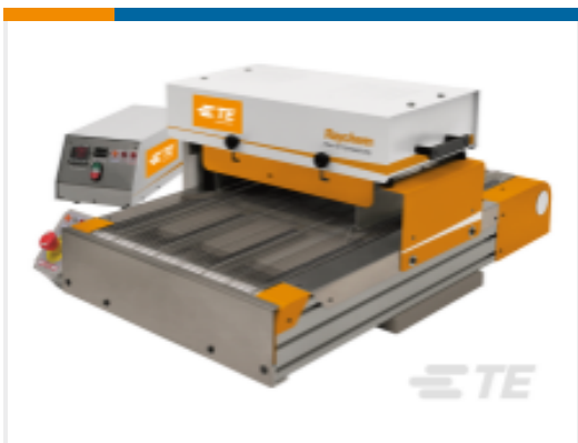
TE Part # 2394980-1 MOD 105 TUN OVEN, 69" ENTRY, STARDARD