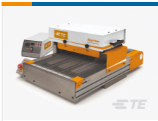
TE Part # 955018-000 CLTEQ-M105-TUNNEL-OVEN