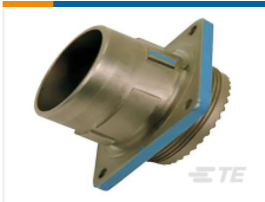
TE Part #YDIV44E17-06SNC009 RECP ASSY