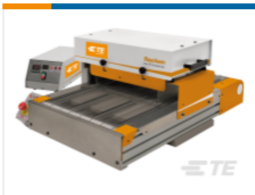
TE Part # 2326489-1 MODEL 105 TUNNEL OVEN, 36" ENTRY, STAND A