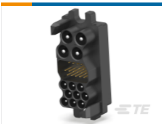
TE Part #6643425-1 CONN,PIN,75Amp MIDDLE DWR