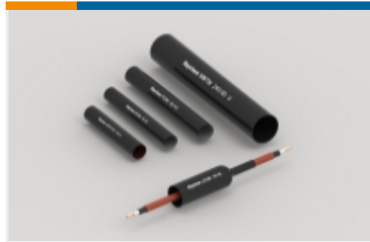
Power Cable Tubing & Accessories(93)