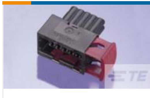
TE Part #1-967241-1 J-P-T HOUSING ASSY 6P