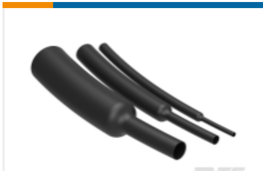
TE Part #5069864018 CGPT 2:1 Heat Shrink Tubing