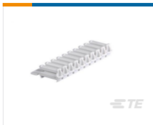
TE Part #1SNK900611R0000 UMH