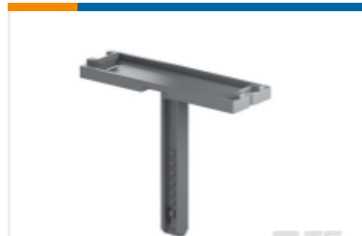
TE Part #1SNK900605R0000 LH.