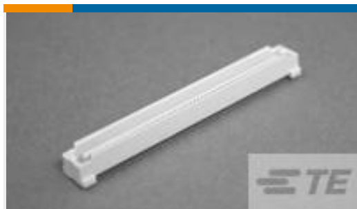
TE Part #5177984-5 0.8FH,P05H.5,120,08/Sn,TU