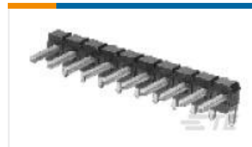
TE Part #825437-2 MOD 2 PINHDR 1X02P.