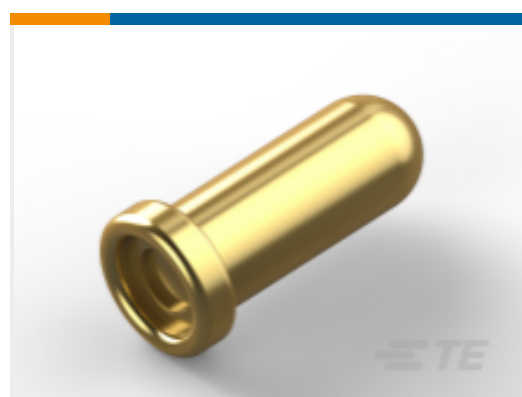
TE Part # CAT-377-MSSCB75 Miniature Spring Sockets: Closed Bottom, Beryllium Copper, 7.5A