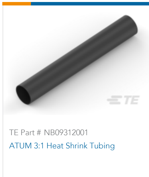
TE Part # NB09312001 ATUM 3:1 Heat Shrink Tubing