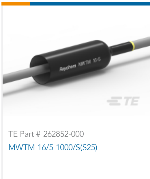
TE Part # 262852-000 MWTM-16/5-1000/S(S25)