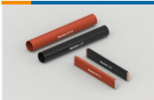
Electrical Heat Shrink Tubing(14)