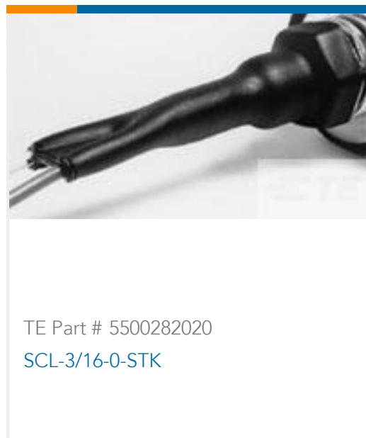
TE Part # 5500282020 SCL-3/16-0-STK